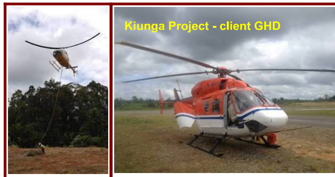
Kiunga Project - client GHD