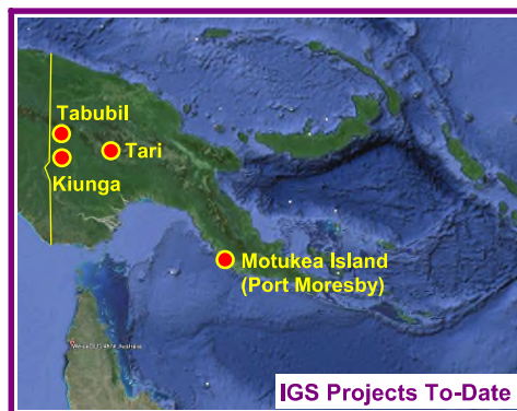
IGS Projects To-Date