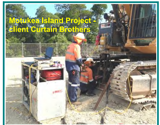
Motukea Island Project - client Curtain Brothers

At others we can use anchors or can tie the rig down - eg to a jack-up barge deck.