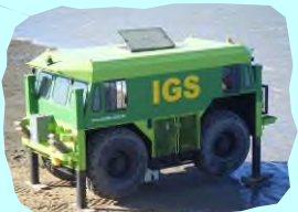
Beryl – 15t 4 wheel drive