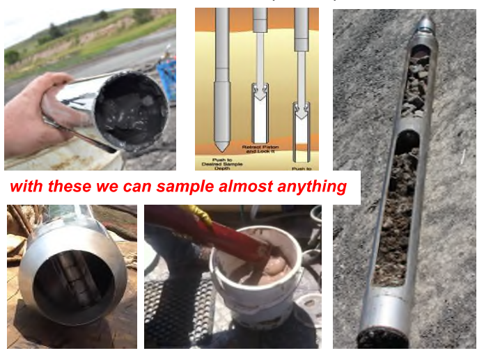
with these we can sample almost anything