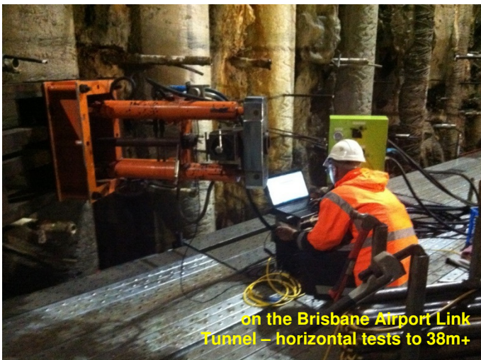
on the Brisbane Airport Link Tunnel – horizontal tests to 38m+