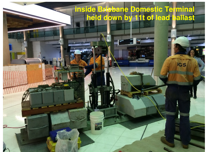
inside Brisbane Domestic Terminal held down by 11t of lead ballast

Multi-purpose “configurable” rig – suited to many purposes and sites