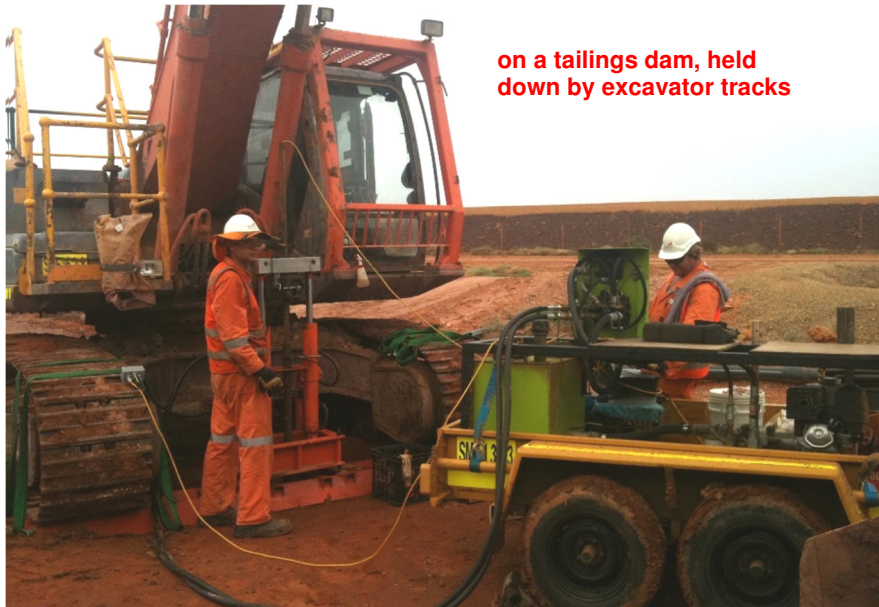
on a tailings dam, held down by excavator tracks