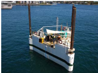
On a jack-up barge Darling Harbour